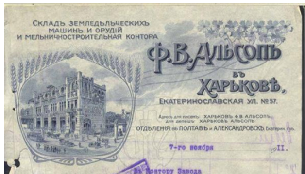
Figure 3. The letterhead of the F. V. Alsop in Kharkiv company. The 1900s