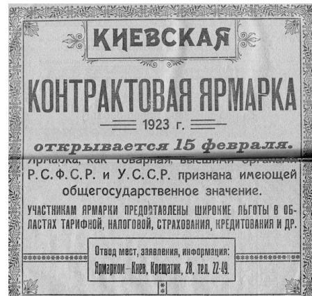
Figure 5. The advertising poster of the Kyiv Contract Fair. 1923