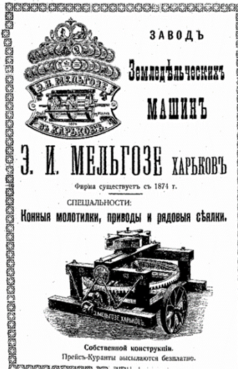
Figure 2. The price list cover of the Plant of Agricultural Machinery named after E. Mehlhose. The 1900s

complex of the textile mill together with its name. In its writing, a certain artistic approach to the creation of the font composition is observed: the word “company” is presented in the abbreviated form with the first letter and the last underlined syllable; the third and fourth words of the name “textile mill” are presented according to the same principle. In this way, all three words are presented in one line based on the principle of symmetry.