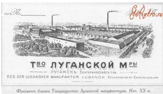
Figure 4. The fragment of the letterhead of the Luhansk Textile Mill Company. Early 20 th century