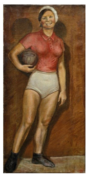
Figure 5. The Girl with the Ball. Tsivchinskii N. V. Oil on Canvas. The 1930s. 73.5 × 36 (http://bonart.kz).

Boychukist by nature, N. Tsivchinskii remained true to the creative principle of the Boychuk school, who "together with his students ... created Ukrainian art in almost all its forms and genres" (Zemlyanaya, 2009a, p. 209), formed with them "a unique style of art — a synthetic style, monumental in the form and nature of creative thinking" (Zemlyanaya, 2009b, pp. 15–16).