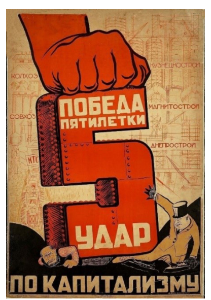
Figure 4. Five-Year Plan's Victory – a Blow to Capitalism! Tsivchinskii N. V. 1931 (http://tramvaiiskusstv.ru)