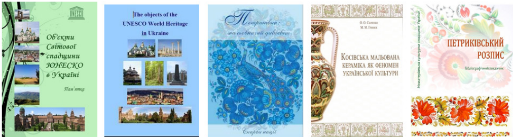
Figure 1. Information and bibliographic publications of the project