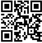
Figure 2. QR code to go to the project web page

The tab structure of these elements is identical and consists of four sections: